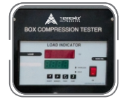
Microprocessor Based Digital Display with Feather Touch Control