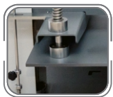
Strong Compression Plate