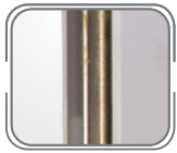
Twin column rugged Structure