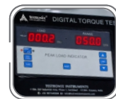
Microprocessor Based Digital Display