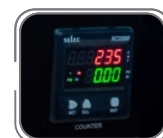
Digital Preset Counter