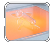
Standard Test Template