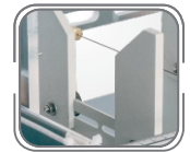
Bottle Neck Holder