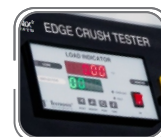
Microprocessor Based Digital Display