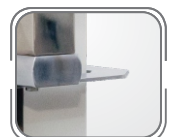
Safety Limit Switches