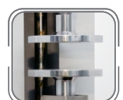
Strong Gripping Clamps