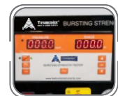
Micro Processor Based Digital Display