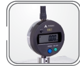
Digital Dial Gauge