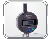
Digital Dial Gauge